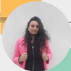
Elmira Alpenidze Banking

“I wanted to contribute to their happiness, and to help fulfill what they are lacking.”