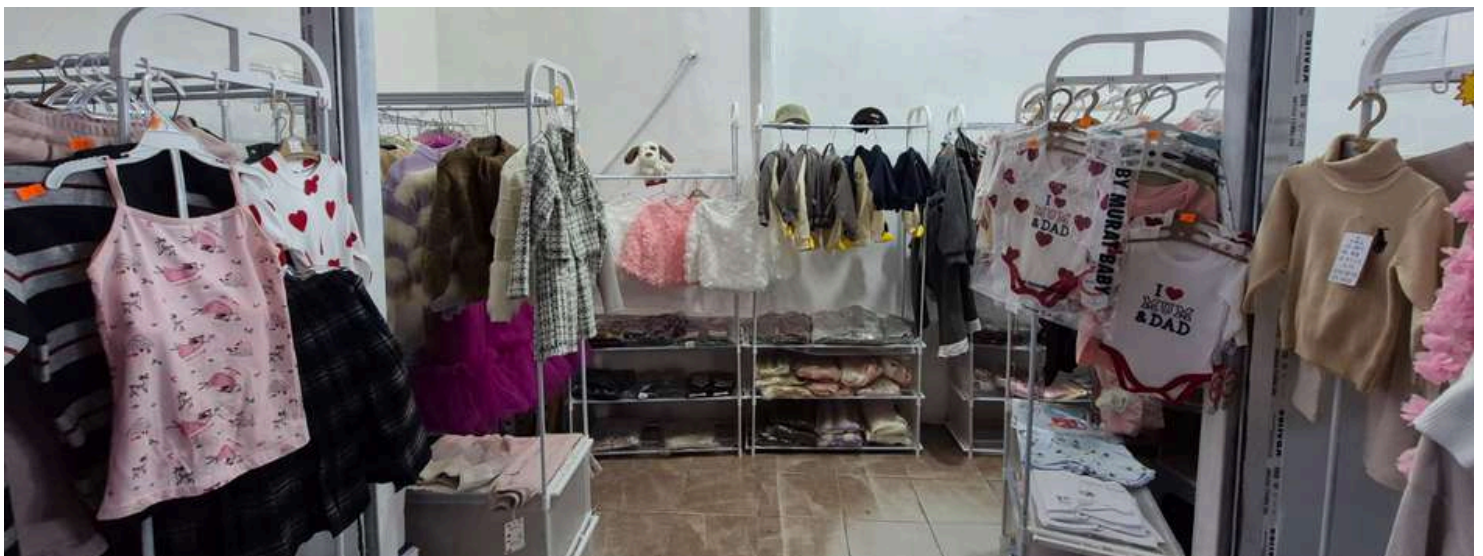
The project is implemented with the support of the Swiss office of International Social Services (ISS).

This success story once again emphasizes the potential of returned migrants and the need to support them for the sustainable development of the country.